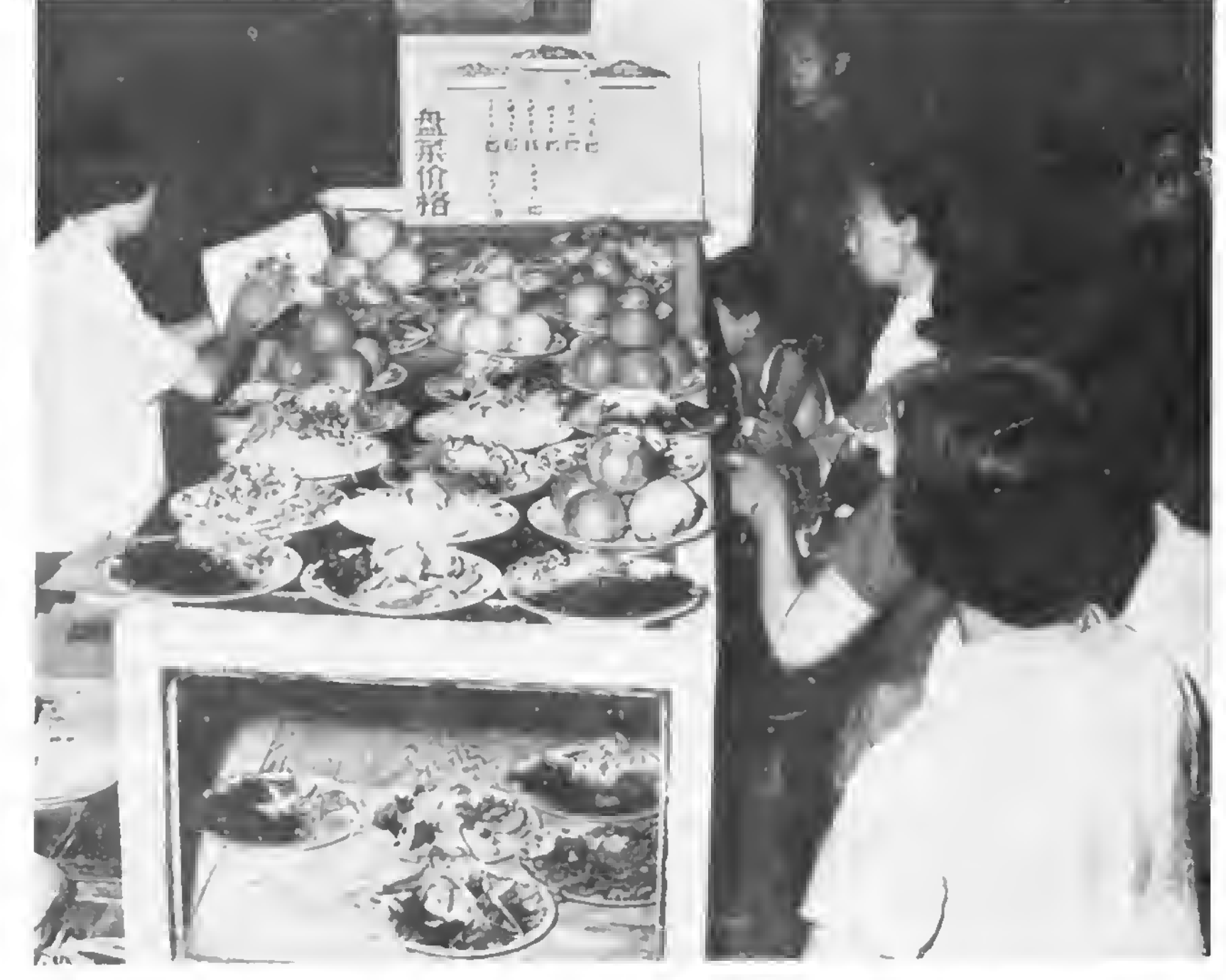
Combinations of meat and vegetables cut and ready to be cooked as special dishes.

The people who serve the customers, the wholesale buyers and members of the shop revolutionary committees set up during the great cultural revolution, are government workers receiving wages. Like the workers in other jobs, they creatively study and apply Mao Tse-tung's thought. Before starting every morning and just before going home each evening, they study Chairman Mao's works together, using them to guide their actions and to assess what they have done during the day. The revolutionary workers say proudly. "We commercial workers will be servants serving the people wholeheartedly, propagandists spreading Mao Tse-tung's thought and fighters defending Chairman Mao's revolutionary line. . . . We will do a better job in purehasing, supplying the market and serving the eustomers. Each at his own post, we will win new merits in seizing all-round victory in the great proletarian eultural revolution."